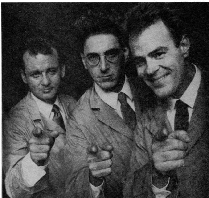
PHOTO: GHOSTBUSTERS PHOTO: COPYRIGHT 1984 COLUMBIA PICTURES INDUSTRIES