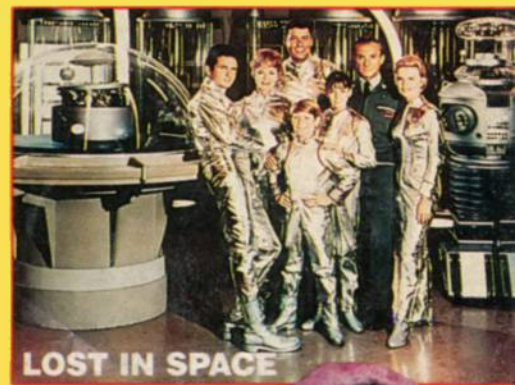
LOST IN SPACE