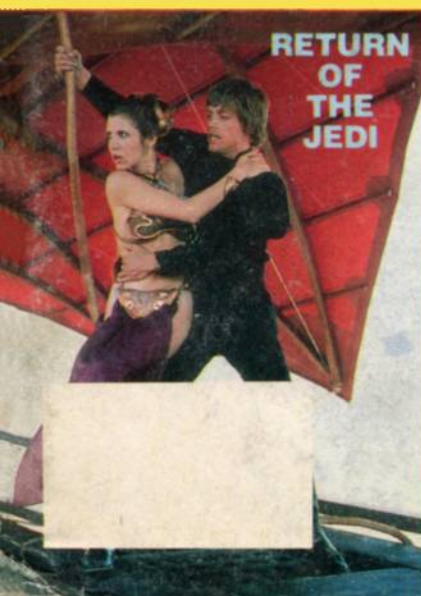
RETURN OF THE JEDI